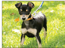
Caramelo is shown on top, but his siblings Dale and Sadie (as well as others) are also available for adoption. Visit our website at epia-echopark.org for all the pics and profiles!